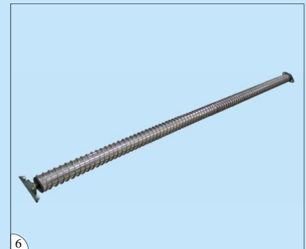
自動展布系統 Automatic Fabric Spreading System