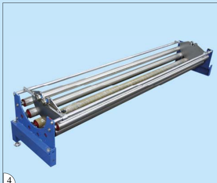
鬆布器 Fabric Loosening Device