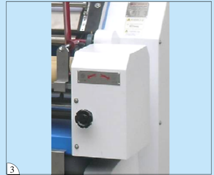
硬捲或軟捲調節裝置 Winding Tension Adjustment Device