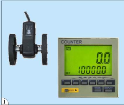
電子計數表(可米/碼轉換) Electronic Meter(Meter&Yardage Switchable)