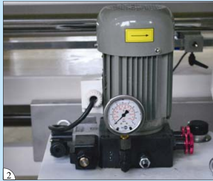
自動追蹤對邊裝置 Automatic Edging Track Device