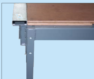
裁床結構圖 cutting table structure