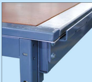
Z 形路軌(選購件) Z track (Options)