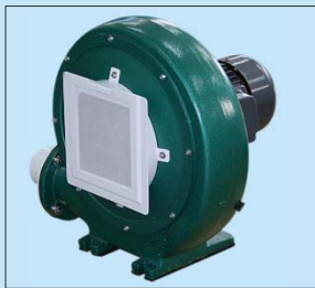
NS-3402-3 吹風泵 Blower