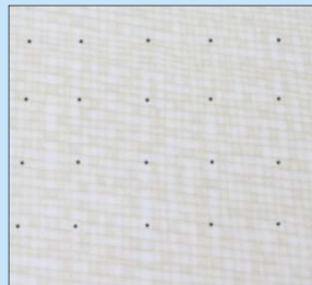
台面風孔 Table air hole