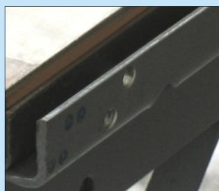
Z形路軌(選購件) Z track (Options)