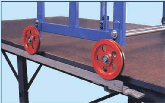
裁床邊路軌 Rail mount on table edge