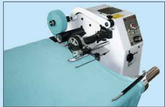
切綑條系統 Tape cutting system