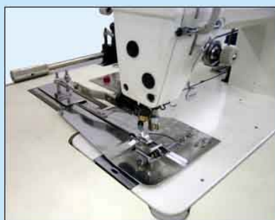
工作示意圖 Schematic Diagram